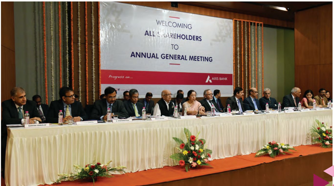
Members of the Bank's Board of Directors attending the Bank's 22 nd AGM in Ahmedabad, India